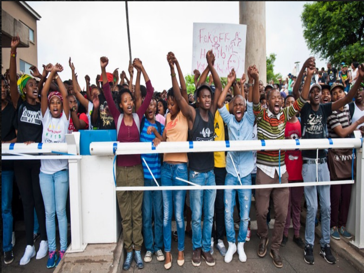
First Day of the #FMF Shutdown