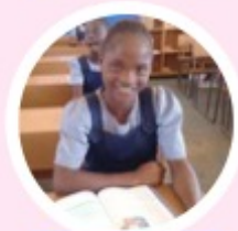
In her seventh year