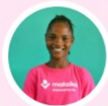
In her sixth year

MALAIKA | Empowering Me | www.malaika.org