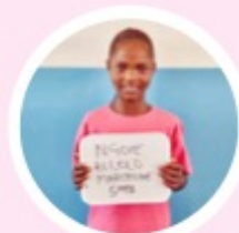
In her fifth year