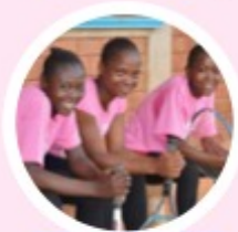
Today, in her 11th year at age 16