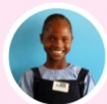
In her third year