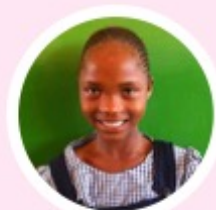
In her fourth year