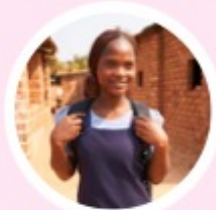
In her eighth year